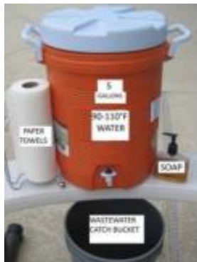
Estación de Lavado Manos