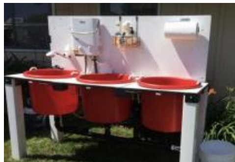
Estación de Sanidad